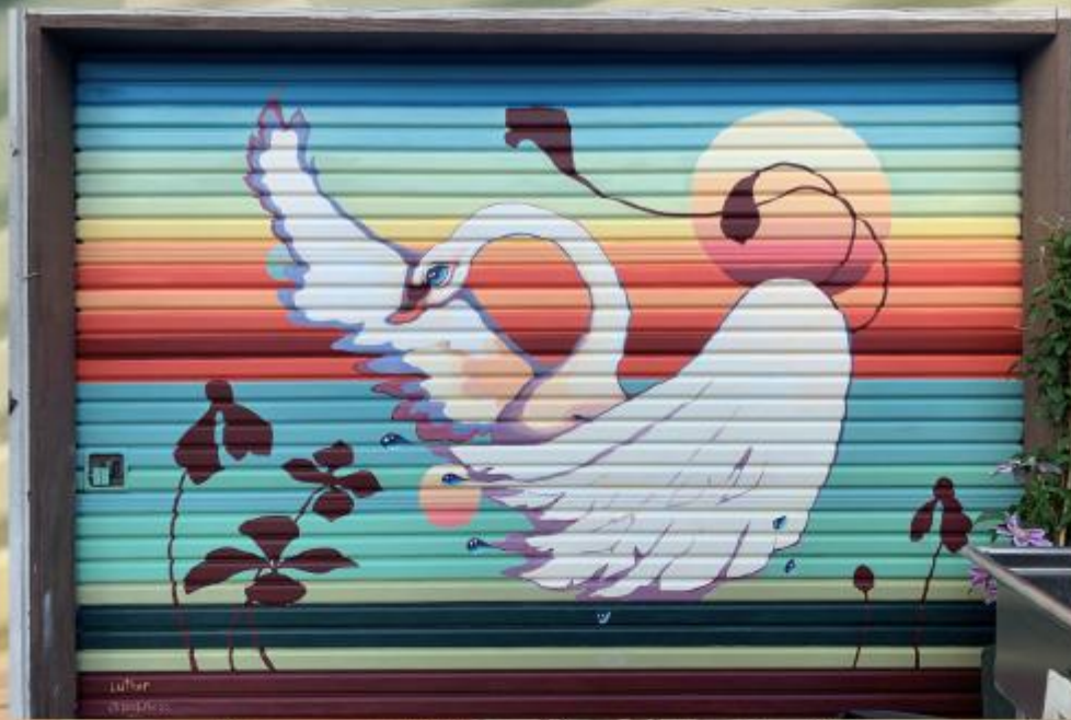
Swan mural. Terra Sage Merchantile 2025 8x11ft