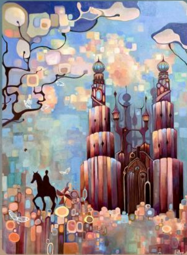
Chilaga, oil painting 5x3.5ft 2025