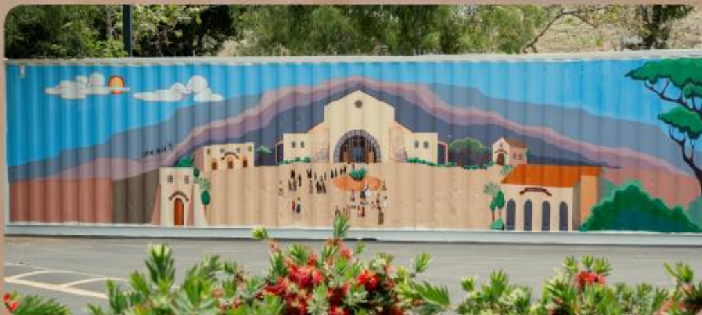
Holy Trinity Church shipping container mural 40x9ft 2024