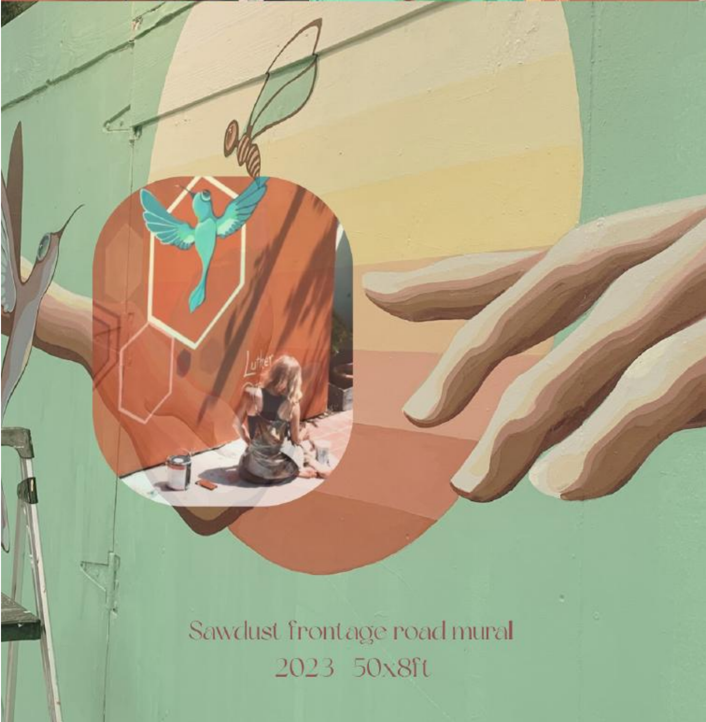
Sawdust frontage road mural 2023 50x8ft