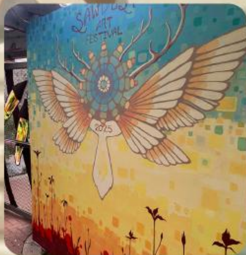
Sawdust selfie mural 2025 8x8ft